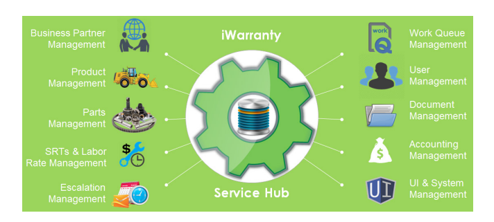
The iWarranty Service Hub enables sharing of crucial data not only between enterprise systems, but all connected stakeholders

Every business needs different business rules, work flow and decision tables and iWarranty service platform enables you to configure these to meet your business needs. iWarranty role based access control (RBAC) enables businesses to easily control which functions and data each user can access. Content and document management capabilities enable you to store various service content including bulletins, manuals and other service documents.