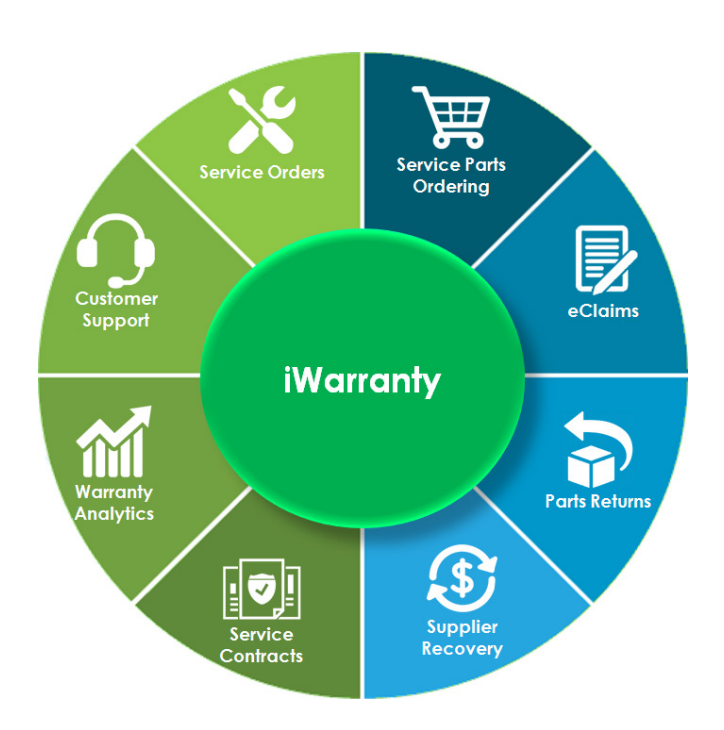
PTC's iWarranty provides an extensive suite of Warranty-related features and functions in one cohesive package