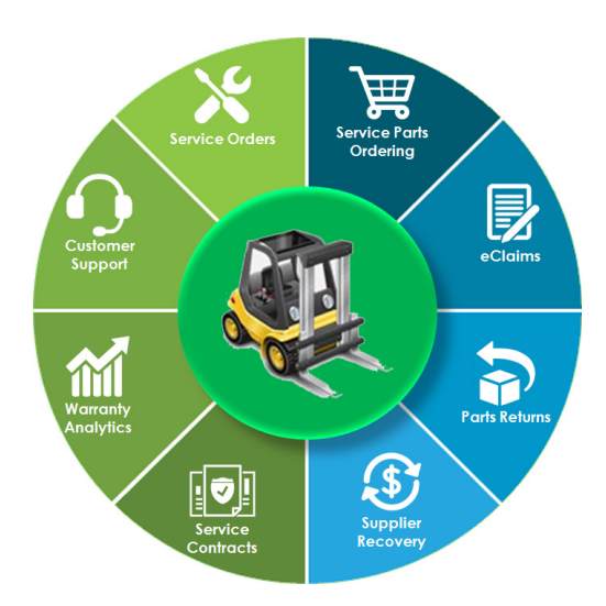
Product Centricity – the key to iWarranty's success

Your product is the virtual center of your universe. That is why special attention has been given in iWarranty to make it 'product centric'. All warranty-related issues have direct impact on both product maintenance, service and support, and new product development. Even if the product performs as advertised, in the eyes of the user, it fails when the supply and service chain fails. You need to have full visibility to every aspect of every component of every product through every phase of its lifecycle and service cycle to be really successful. iWarranty is the best solution to provide such extensive visibility.