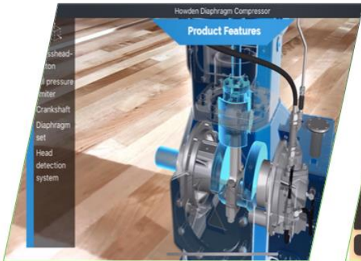
On a Plane